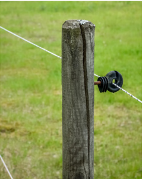
Electric fences are specially insulated from the ground and can pick up an induced charge from transmission lines.