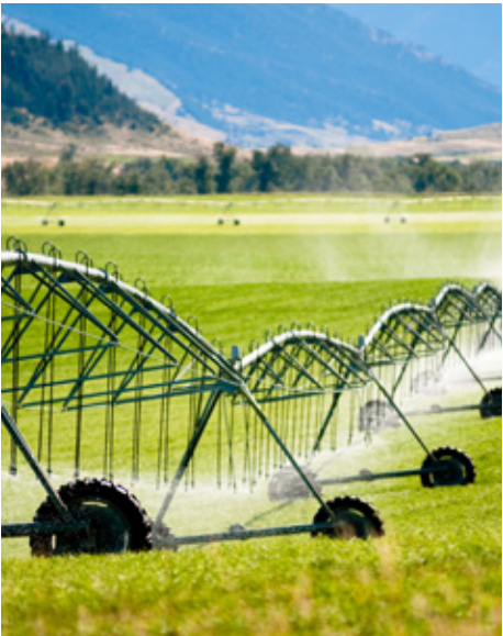
You should never allow a solid stream of water to hit a transmission line wire. Be sure to note the guidelines in this section.